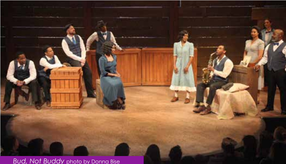
Bud, Not Buddy