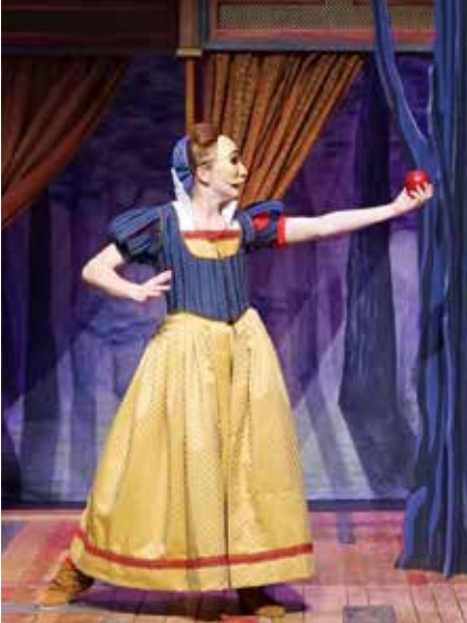
The Commedia Snow White and the Seven Dwarfs

In addition to performances, audiences enjoyed our many Education programs, Santa's Bag, Celebrate! and more.