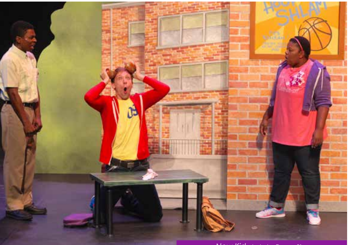
New Kid