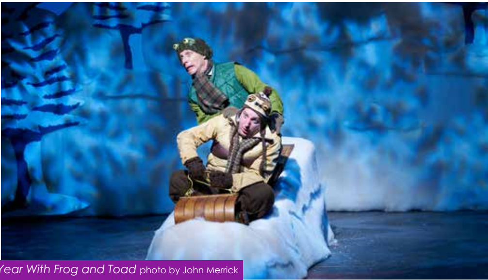
A Year With Frog and Toad