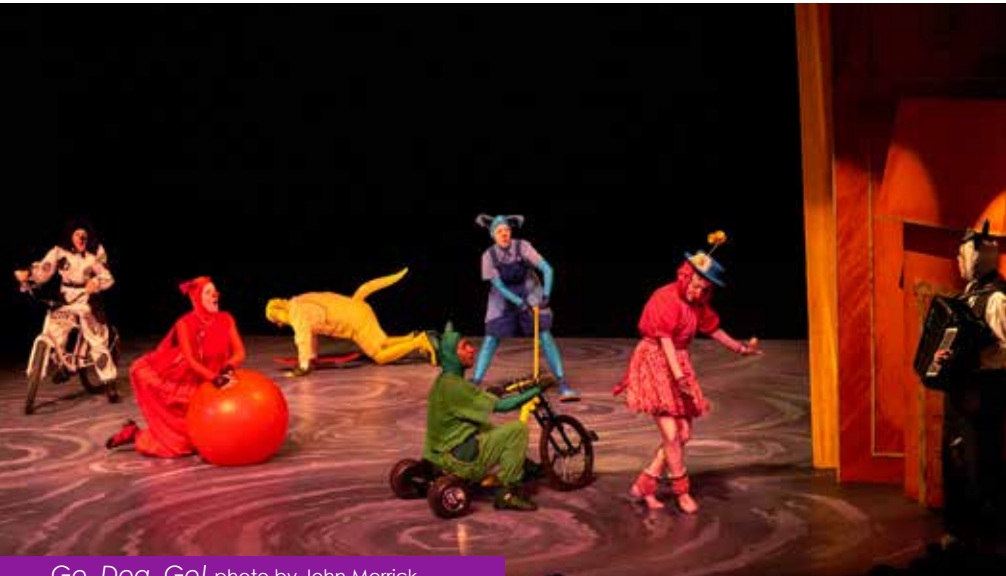
Go, Dog. Go!