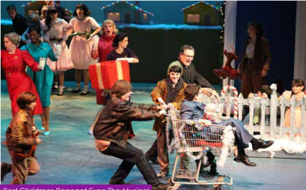
The Best Christmas Pageant Ever: The Musical