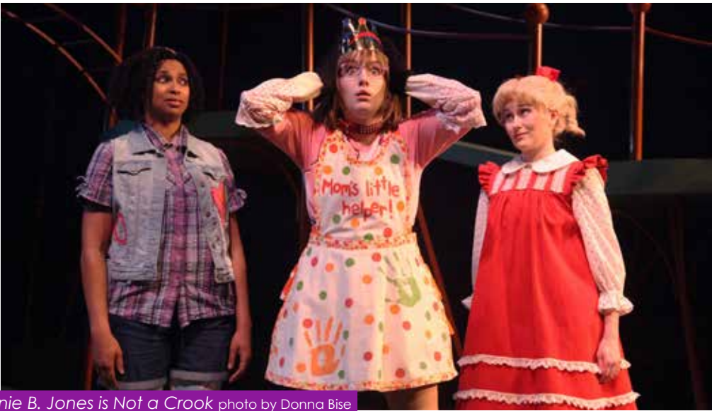
Junie B. Jones is Not a Crook