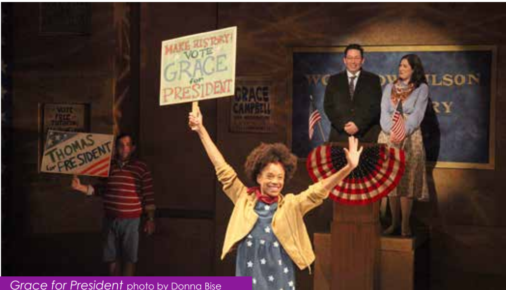
Grace for President