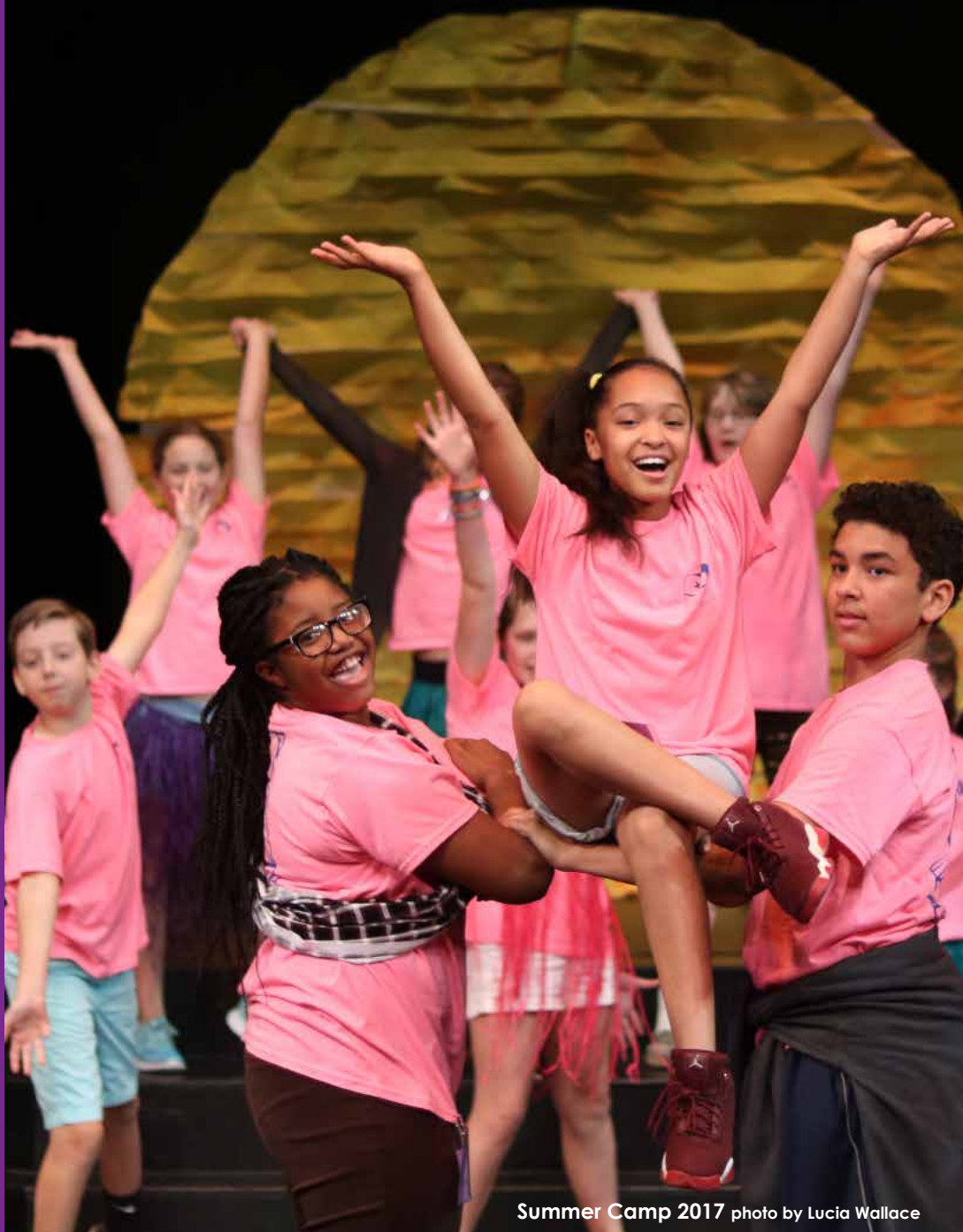
Summer Camp 2017